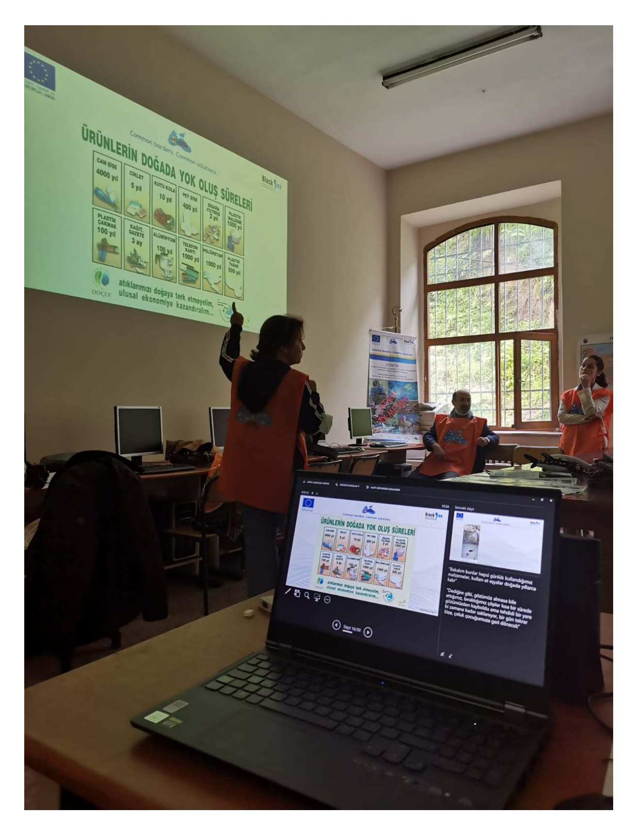
Common borders. Common solutions.