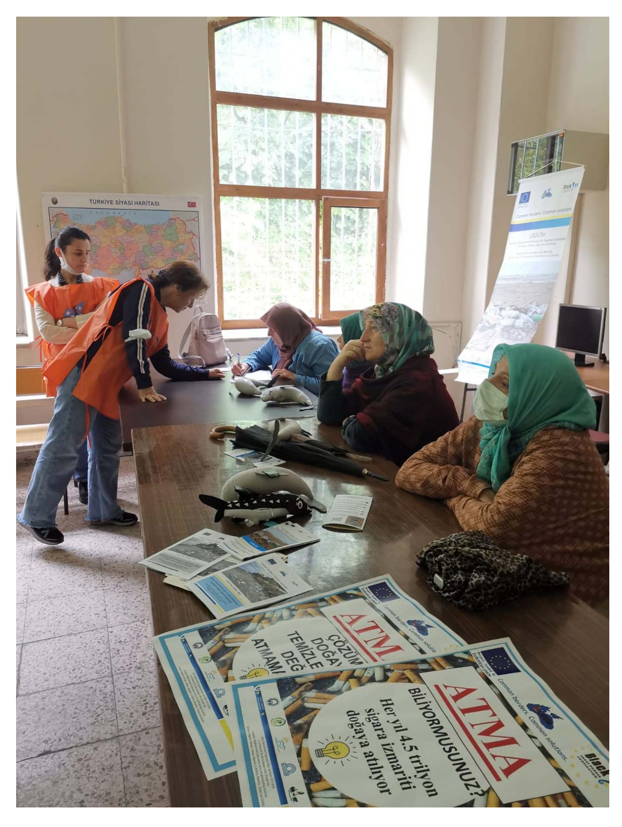
Common borders. Common solutions.