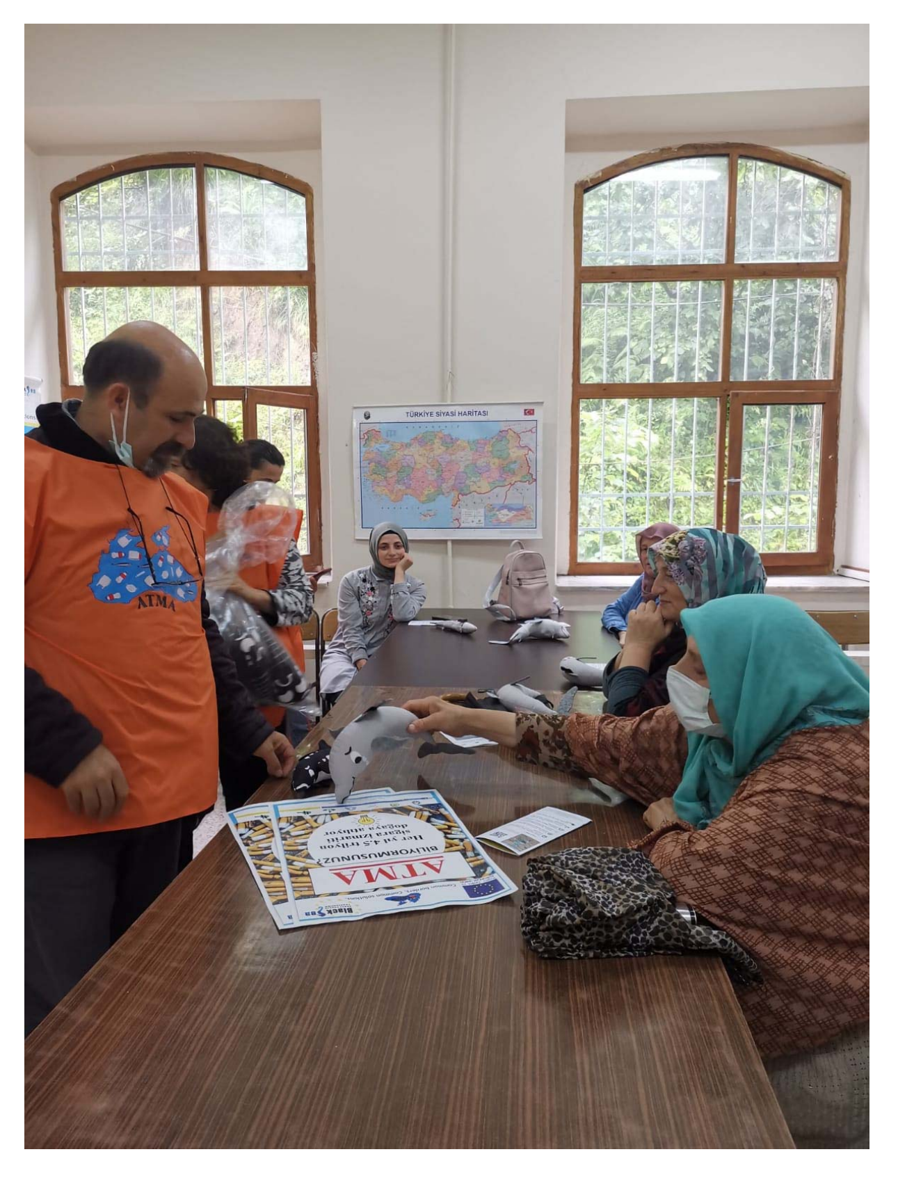
Common borders. Common solutions.